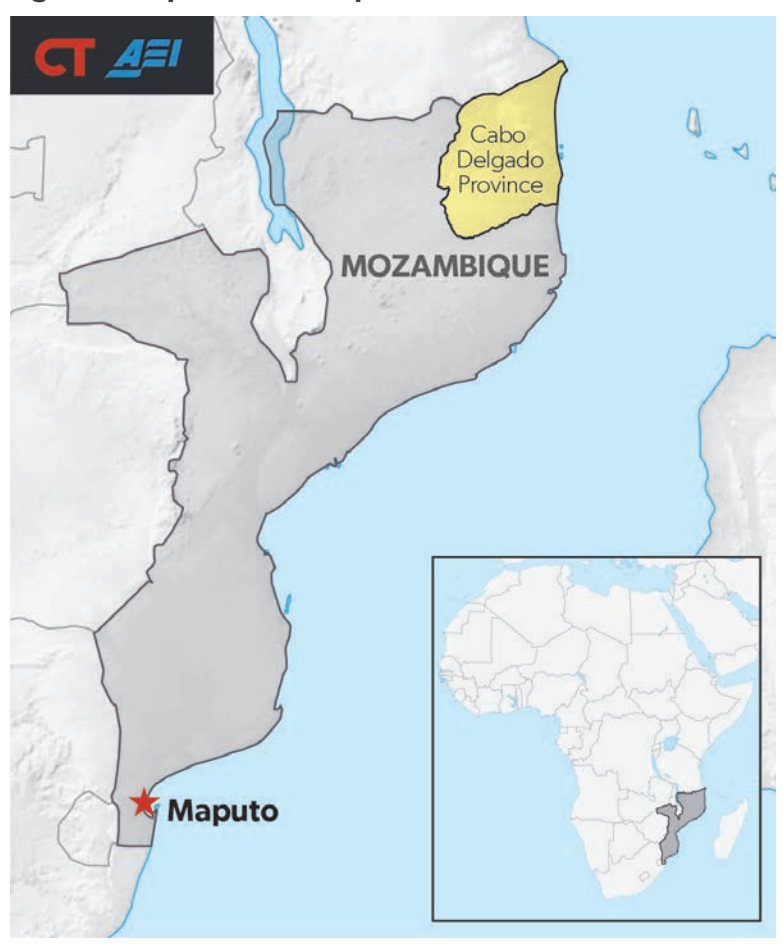
Figure 1. Map of Mozambique

The Salafi-jihadi insurgency in Mozambique, like others in Africa, is co-opting and stoking local conflicts by translating historical narratives of grievance into extremist ideological terms. This insurgency, located in the remote province of Cabo Delgado in northern Mozambique (see Figure 1), is rooted in long-standing social and economic conditions. But