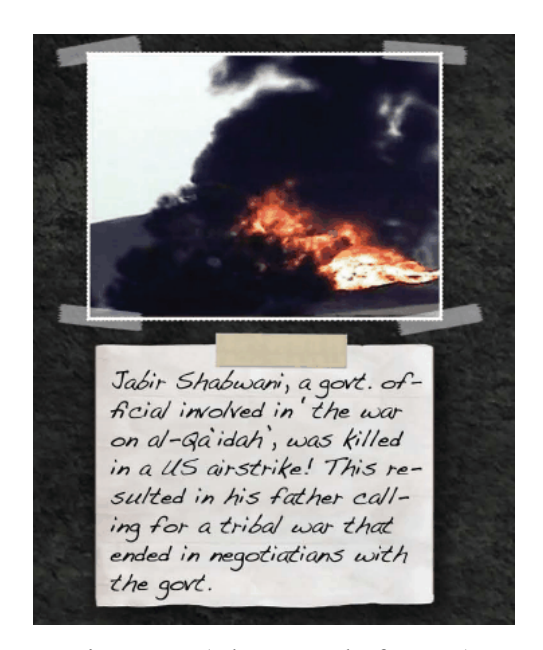
Figure 4. (The AQ Chef, 2010)

The magazine contains articles of detailed personally narrated stories calling on the all Muslims to pursue personal jihad on Western targets and civilians, as well as stories of global events, that can be attributed to the West coupled with specific detail on how to attack and kill the 'kuffar'. Other examples include Figures 4 and 5, as follows: