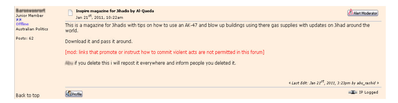
Figure 6. (Junior Member, 2011)

Figure 6 and 7 below are two snapshots of conversations between a Junior Member and Moderator from a mainstream online Australian political forum, "OzPolitic". This brief, but worrying conversation illustrates the above observations.